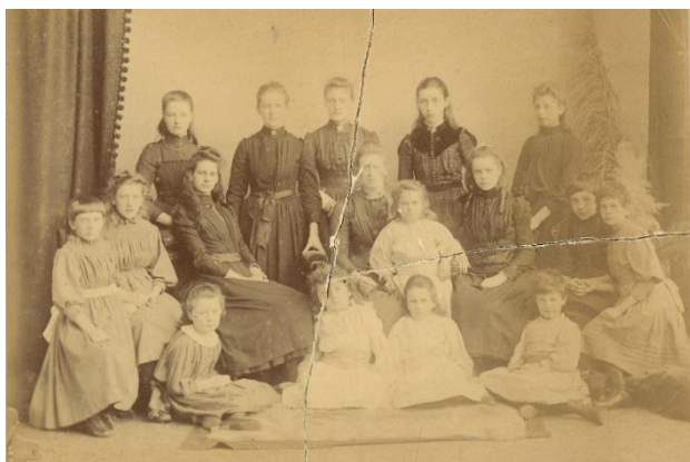
The School, 1889

The history of Hollygirt throughout its 140-year existence is truly fascinating. You will get the chance to find out much more at the event as we have booked an extra side room, which will contain lots of interesting memorabilia, photographs and information about Hollygirt through time.