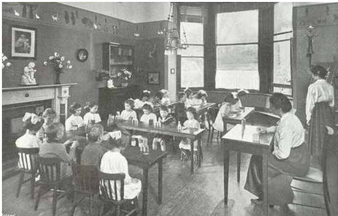
Room 1 (Senior School) in 1922